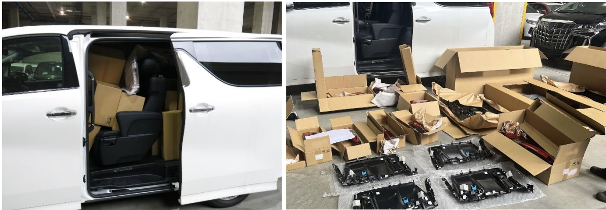
New vehicle spare parts found inside motor vehicles in the LW operated by Trans Point Agency.